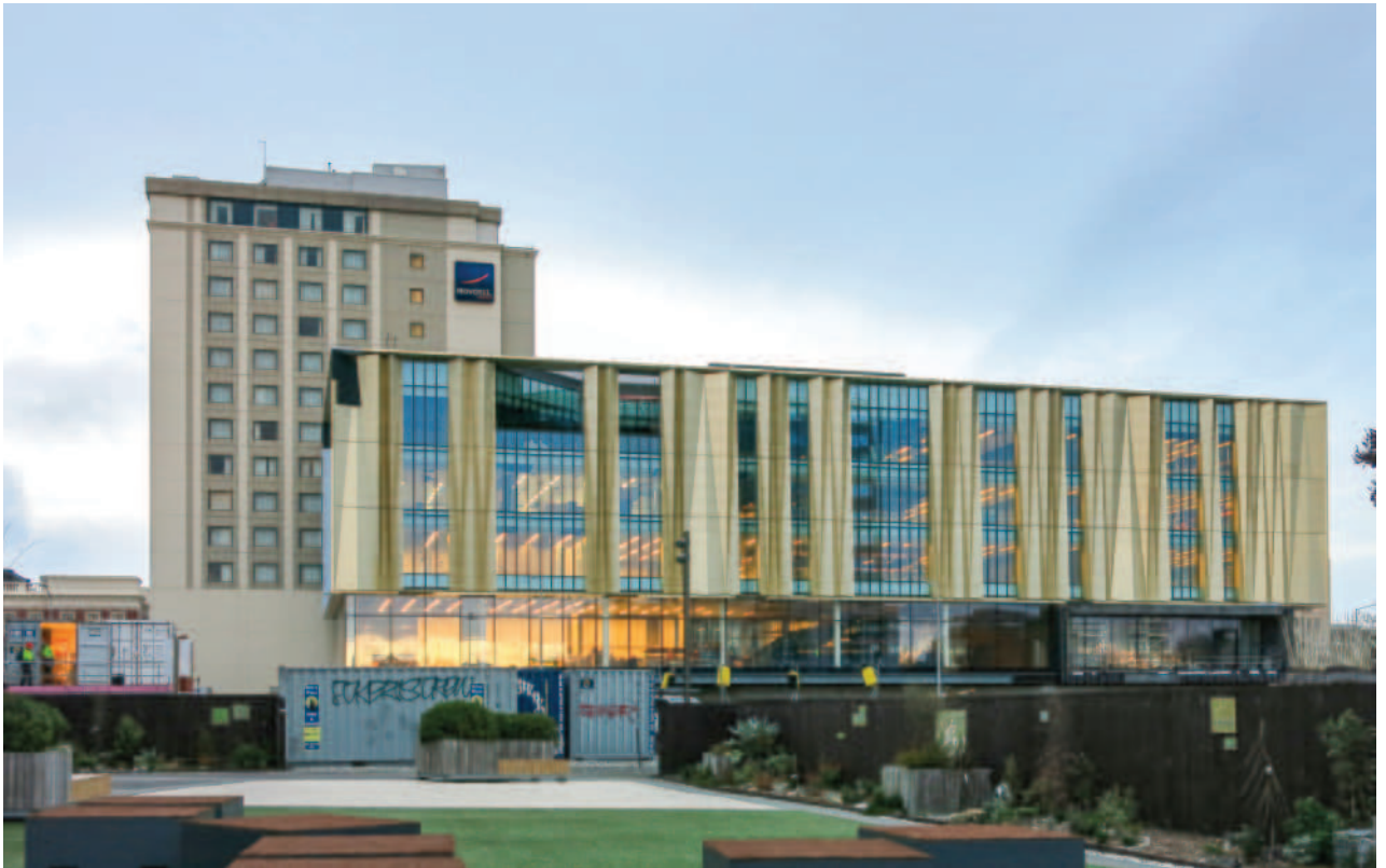
'Tūranga' - North Facade facing Tuahiwi. (Architectus and Schmidt Hammer Lassen)