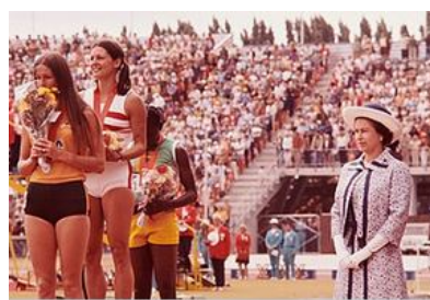
Elizabeth II at medal ceremony