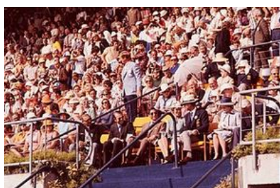
Elizabeth II, Prince Philip, Duke of Edinburgh, Anne, Princess Royal and Charles, Prince of Wales